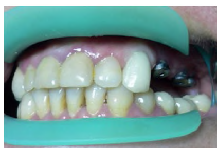
Fig. 2. Gum shapers on implants in the area of 2.4, 2.6, 2.7 teeth

After 1 month, the total potential of all muscles increased by 1064 \mu\text{V} \cdot \text{sec} .