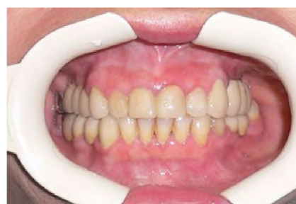
Fig. 4. View of the oral cavity with a dental prosthesis on implants in the area of 2.4, 2.6, 2.7 teeth