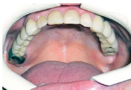
Fig. 3. Metal-ceramic prosthesis with screw fixation on implants in the area of 2.4, 2.6, 2.7 teeth