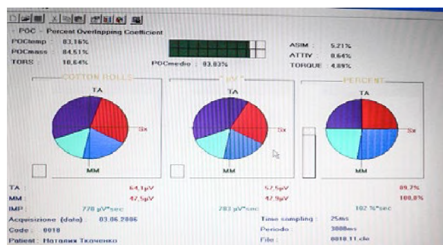
Fig. 6. EMG after applying and fixing the prosthesis