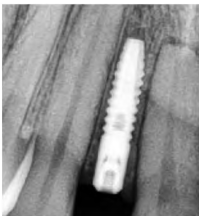
Fig. 6a, b. X-ray control for 3 months after surgery.