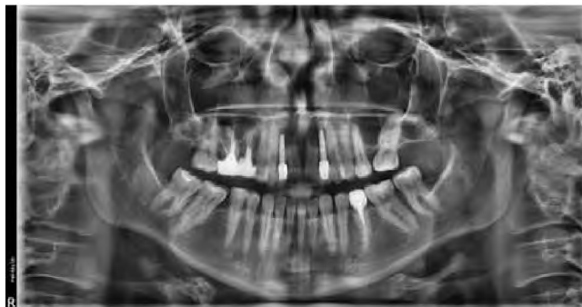
Fig. 10. The final X-ray.

X-ray examination data at the end of prosthetics showed good signs of osseointegration and high precision of all structural elements (Fig. 10).