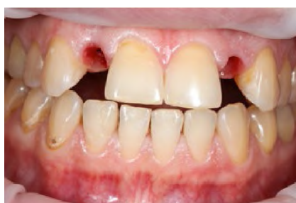
Fig. 8. View of newly formed scalloped edge of the gums in zones 1.2 and 2.2.