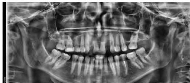
Fig. №2. Panoramic X-ray patient at the time of treatment.

To prepare for the operation, a clinical and laboratory examination of patients was carried out. The X-ray examination of the teeth and jaws was conducted (digital intraoral X-ray images, pantograms, CT-scans with three-dimensional reconstruction of the image).