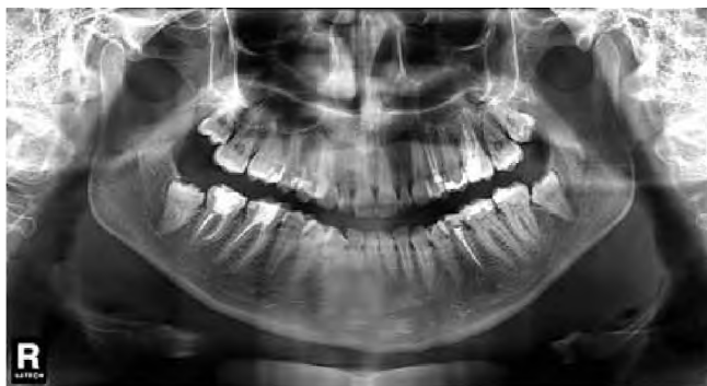
Fig.1. Patient D. 32 years, absent teeth 1.2 and 2.2.