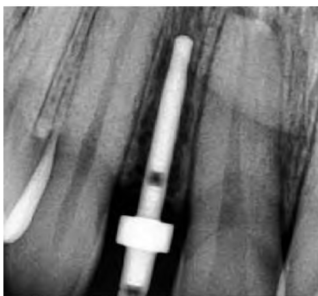
Fig. 5. Intraoperative dental X-rays made to check the parallel positioning of the implants. In the areas of 1.2 and 2.2 teeth, two implants of 3.6 diameter and 10 mm length were installed.