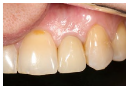
Fig. 9. View of the finished work in the mouth.