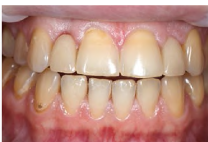
Fig. 7. Type of temporary crowns on implants 2.1. and 2.2.